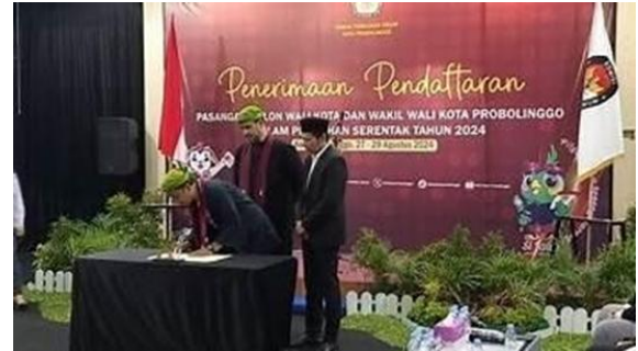
Figure 4: Registration of Candidates for Mayor and Deputy Mayor 2024

functions and between the centre and regions.