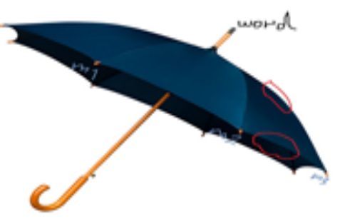
Figure 2. Source as subjectively producing (strong), target as choosing one of characteristics (ghaaleez, or taalkh, or teereh), or the option of coinage for two contexts.

Figure 1. An umbrella figure; the word of top (strong) as umbrella covers three characteristics of tea.