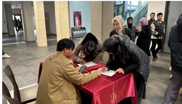
Figure 3. Attendance for the international student

The event was attended by 55 international students at Istanbul Sabahattin Zaim University who came from various countries such as Turkey, Afghanistan, Palestine, Sudan, and Madagascar, Africa.