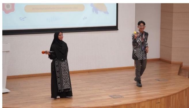
Figure 7. Role-play for implementing Indonesian language.

Not up to the conversation between the two sides, the host also appointed two international students to be able to go up on stage to present what they have understood and answer questions from the host, after, there are gifts for those who are able and brave to go up on stage. According to Kasma F. in her journal “PENGAJARAN BAHASA INDONESIA UNTUK PENUTUR ASING (BIPA) DAN PENGENALAN BUDAYA LOKAL BUGIS-MAKASSAR”. BIPA teachers must promote local culture and tourism. BIPA teachers are recommended to introduce local culture to foreign speakers with an integrated model in teaching materials as the teacher's contribution to the advancement of Indonesian culture and tourism. 10