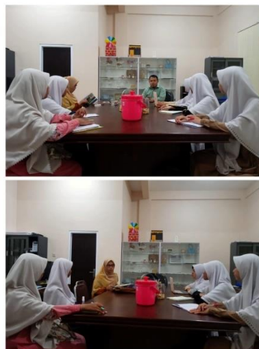
Figure 4. Discussing about Indonesian Culture with supervisor of KKN International Turkey

The event was attended by 55 international students at Istanbul Sabahattin Zaim University who came from various countries such as Turkey, Afghanistan, Palestine, Sudan, and Madagascar, Africa.