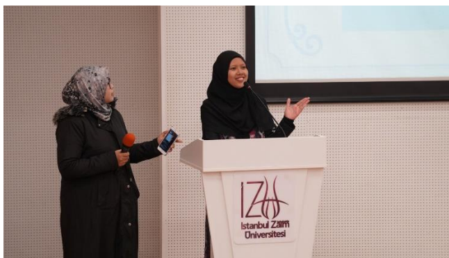
Figure 11. Presenting about Indonesian culture with the translator

At each stage when KKN participants delivered the material, there were slides and videos displayed to understand international students about Indonesian culture more deeply. Then, when explaining about food, according to Dewi, KKN participants distributed souvenirs of traditional Indonesian snacks to international students at Istanbul Sabahattin Zaim Univeristy. 11 And finally, at the stage of explaining the education profile, it is explained in general about education in Indonesia and then objectified into pesantren and specified to Gontor and UNIDA at the end of the explanation.